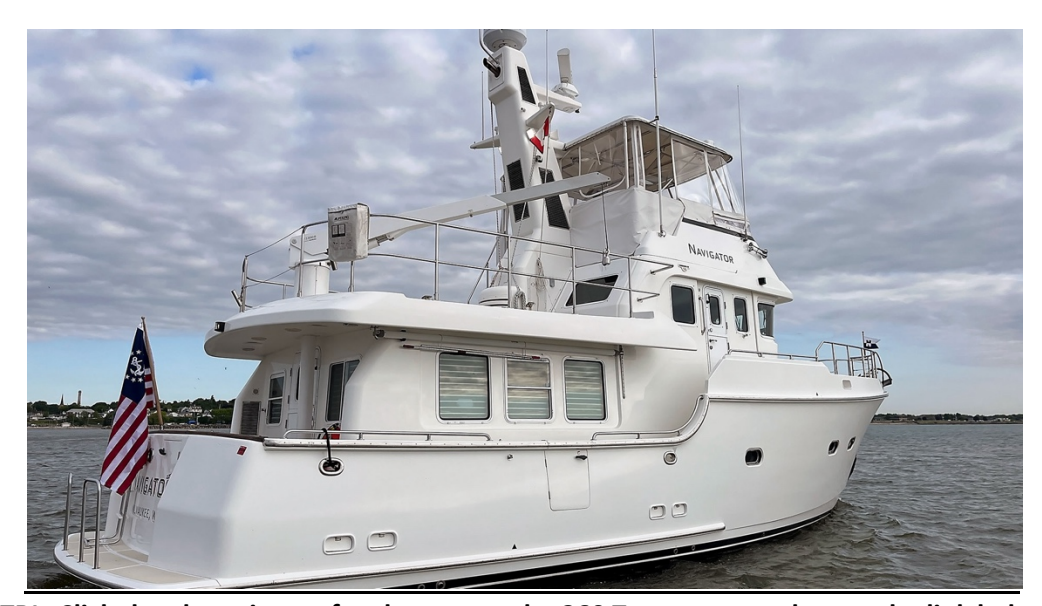
CTRL+Click the above image for shortcut to the 360 Tour or cut and paste the link below.

https://360trawlerspin.com/tours/navigator/index.htm